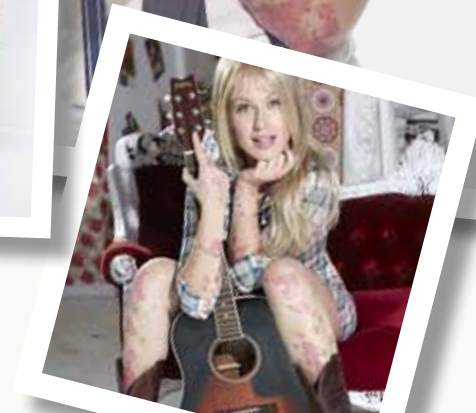
To watch the video, "What Is Plaque Psoriasis?," scan this image with your smartphone or text "CariDeeX" to 80800.